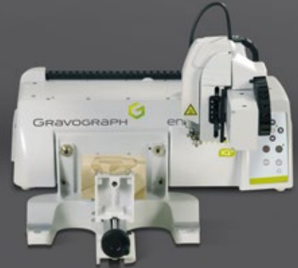
M40 Deep vice